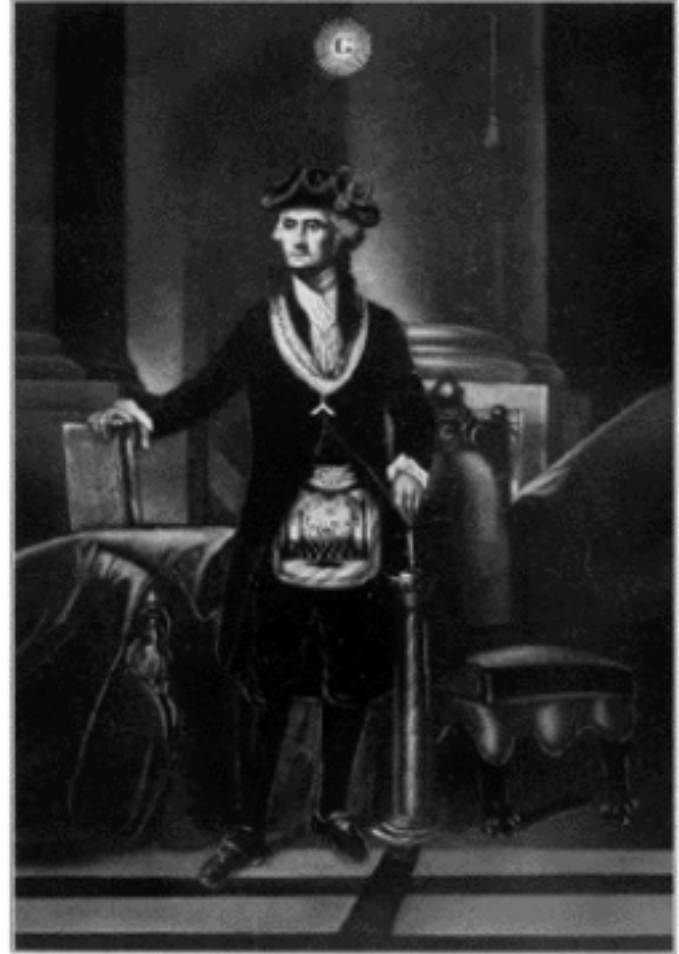
GEORGE WASHINGTON Worship Master of Alexandria (Va.) Lodge No. 22

2888 N. Arrowhead Avenue • San Bernardino, CA 92405 Phone: (909) 889-9801 • E-mail: sbmasoniclodge178@yahoo.com