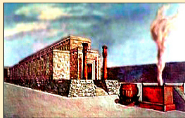
King Solomon's Temple and the Altar of Incense

1380 East Highland Ave. – San Bernardino, CA 92404 Phone: (909) 486-3701 – Email: sbmasoniclodge178@yahoo.com